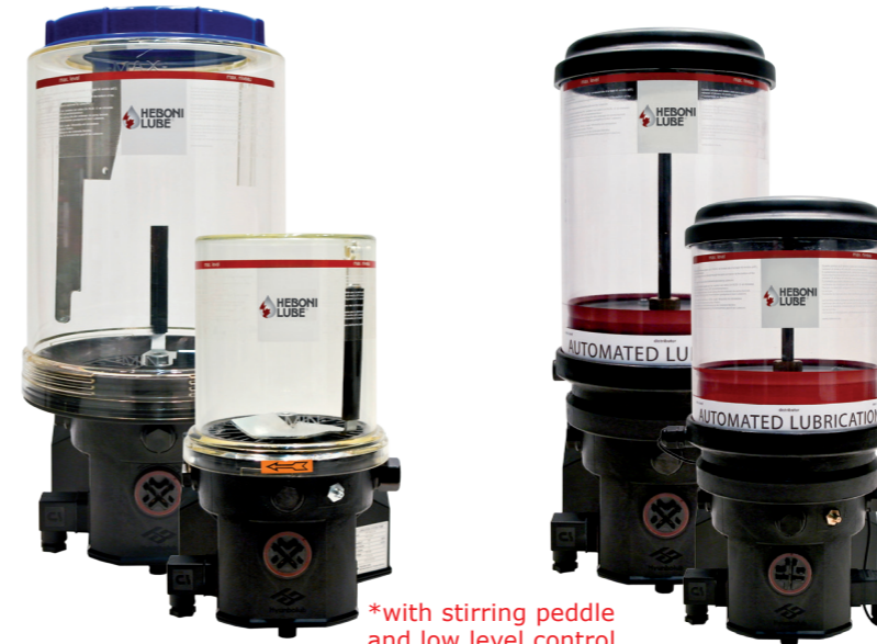
*with stirring peddle and low level control